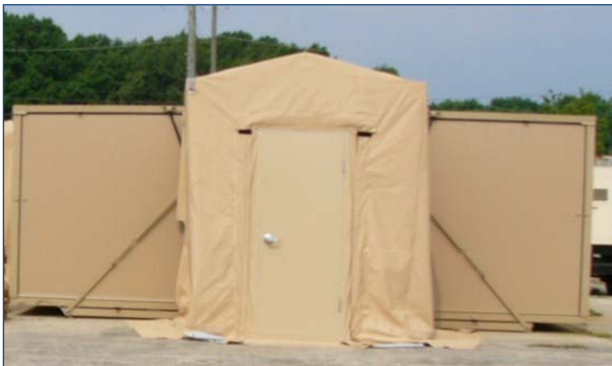
Vestibule shown with solid door and colour Desert Tan, attached to expanding shelter (Mobile Forensic Laboratory)